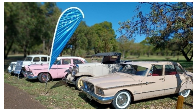
Member's cars out for the day